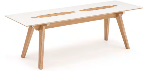
Table top 25mm plywood core. Legs and under support rail 50mm plywood core with laminate faces and white balancer under the top.