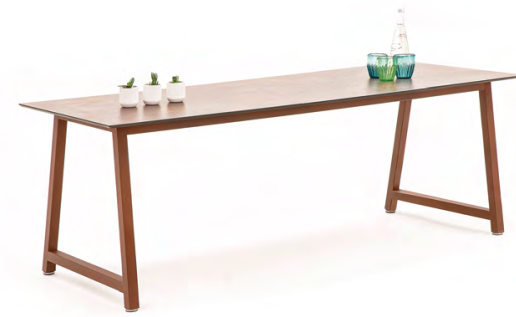
Table top 12mm Solid Grade Laminate. Welded frame powder coated steel. Complete with stainless feet.