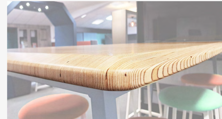
Clear lacquered 36mm barrel shaped plywood end grain top with a softly sculpted edge profile.