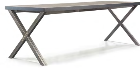
Table top 50mm birch core with laminate faces. Industrial style welded leg frame powder coated steel. Complete with stainless feet