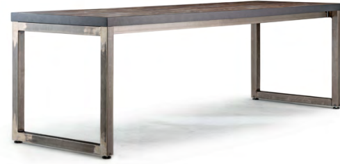
Table top 50mm birch core with laminate faces. Industrial style welded leg frame powder coated steel. Complete with stainless feet