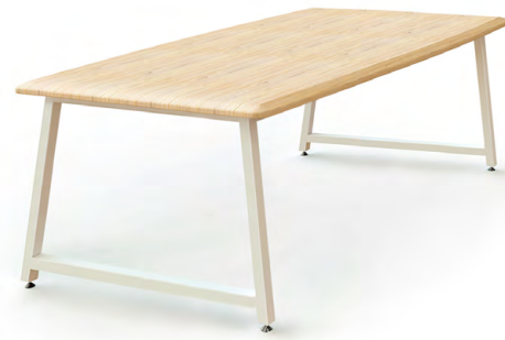
Table top 36mm thick sculpted Plywood. Welded frame powder coated steel. Complete with stainless feet.