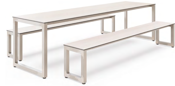
Table top 12mm thick Solid Grade Laminate. Welded stainless steel frame. Complete with stainless feet.